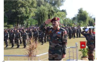
STRATEGIC PARTNERSHIP FORUM

i. The US-India Strategic Partnership Forum has announced that Mastercard CEO and President Ajay Banga and Wipro